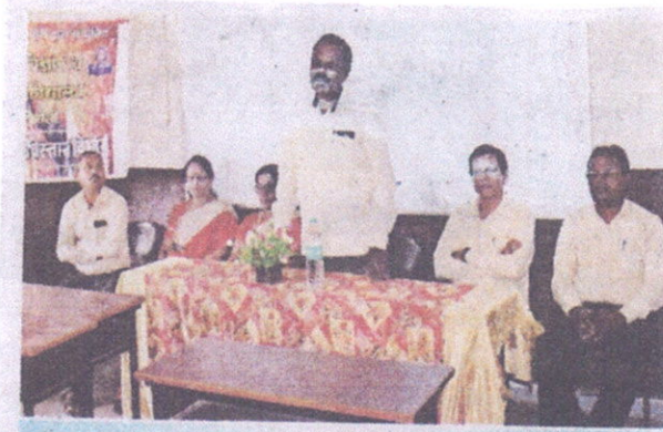
महात्मा गांधी महाविद्यालय आरमोरी